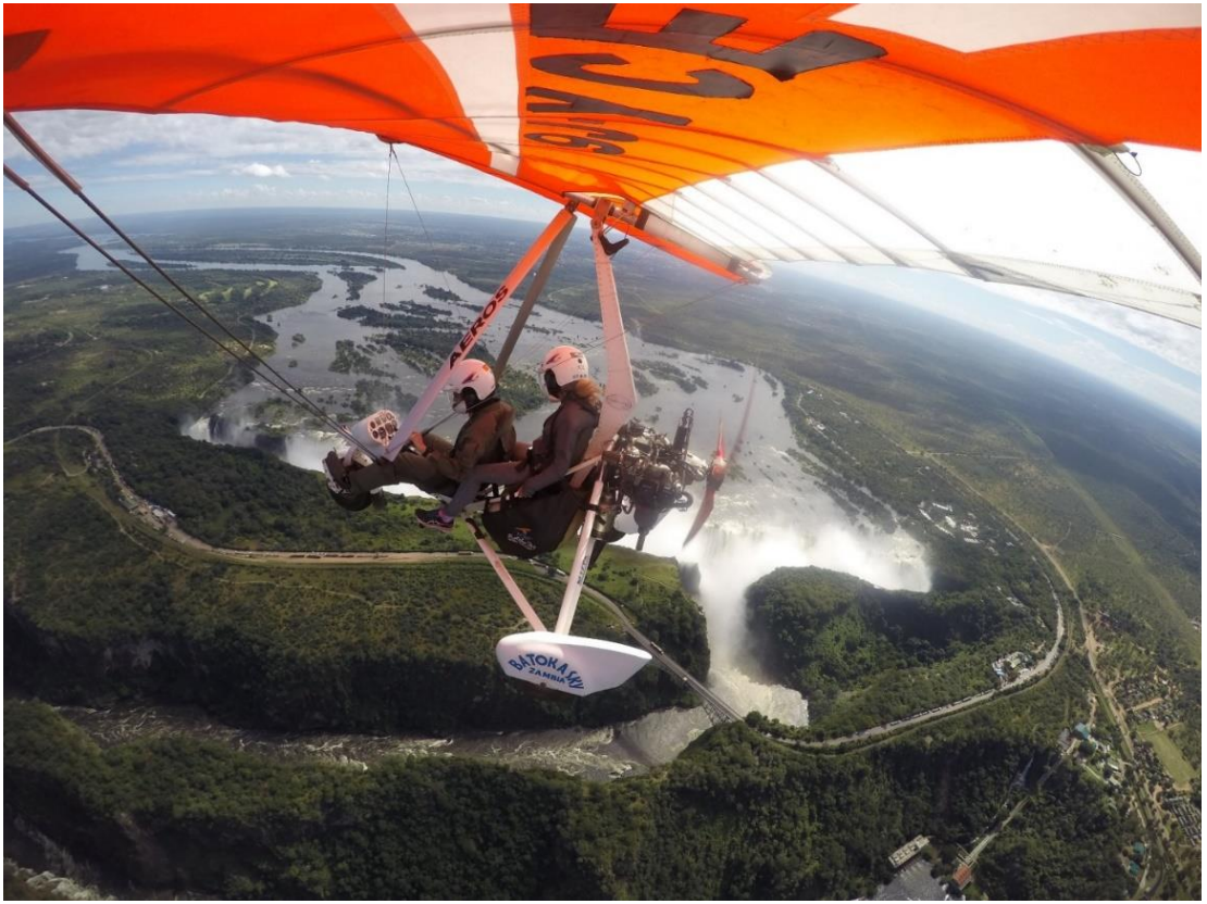
Microlight flight over Victoria Falls