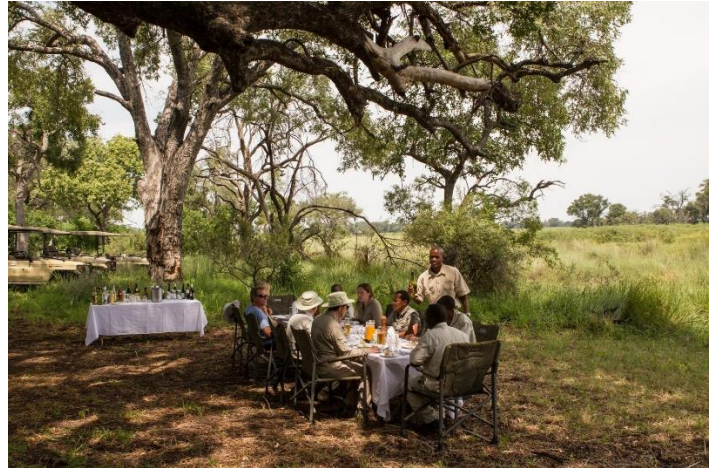
Bush picnic in style