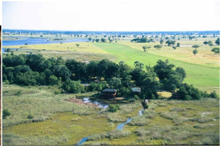
Shinde's vast concession as seen from the air