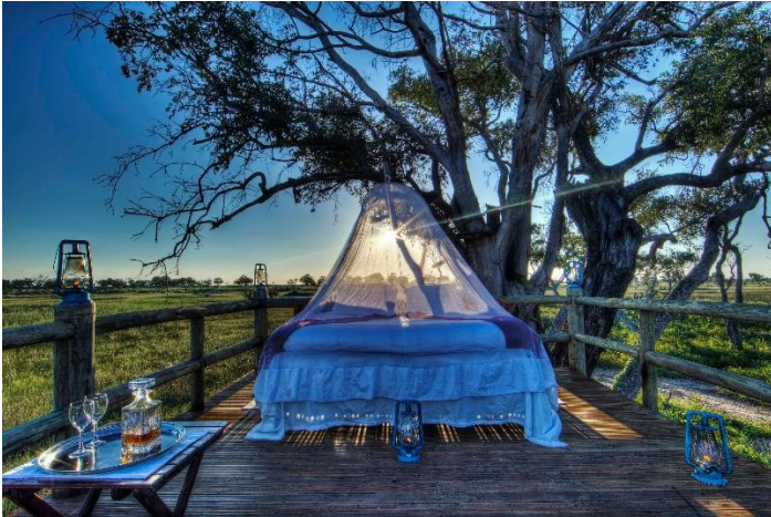
Kanana sleepout deck

meet your pilot for a short flight over the Okavango Delta to the camps airstrip where on arrival you will be met by your guide who will transfer you on an open safari vehicle to camp.