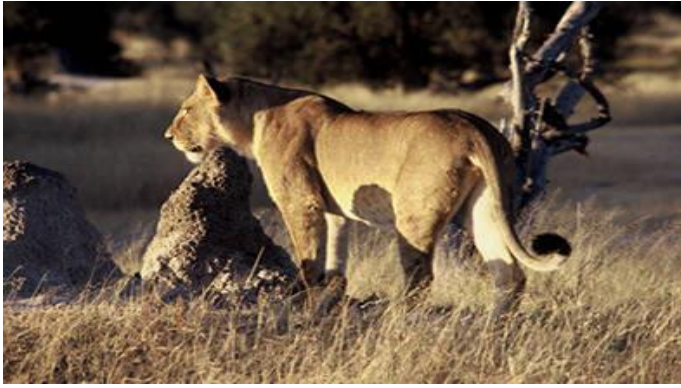
Shinde is 'cat' country